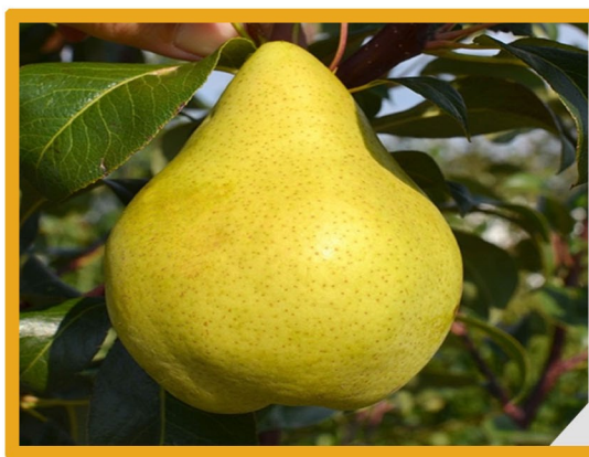
King fruit pear (French wick pear)

early and fresh, long cone, sweet and juicy