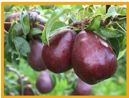
Red pear (anjo)

Some of the pear varieties available are :