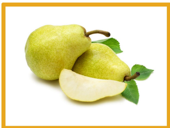
Duchess pear (Duchess pear)

early and fresh, long cone, sweet and juicy